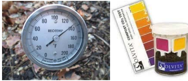
Figure 5. Temperature probe, Solvita Maturity Test