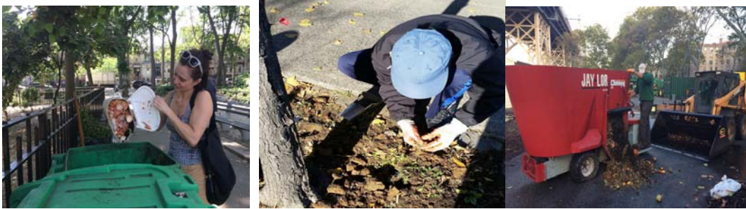
Figure 1. Drop-off location; compost use; mixer at processing site

The processing site is on NYC Parks Department land. The NYC Compost Project originally had informal permission to use an underutilized section of the NYC Parks compound in 2012 and, in 2016, signed a license agreement with NYC Parks to use and develop another section of the NYC Parks compound.