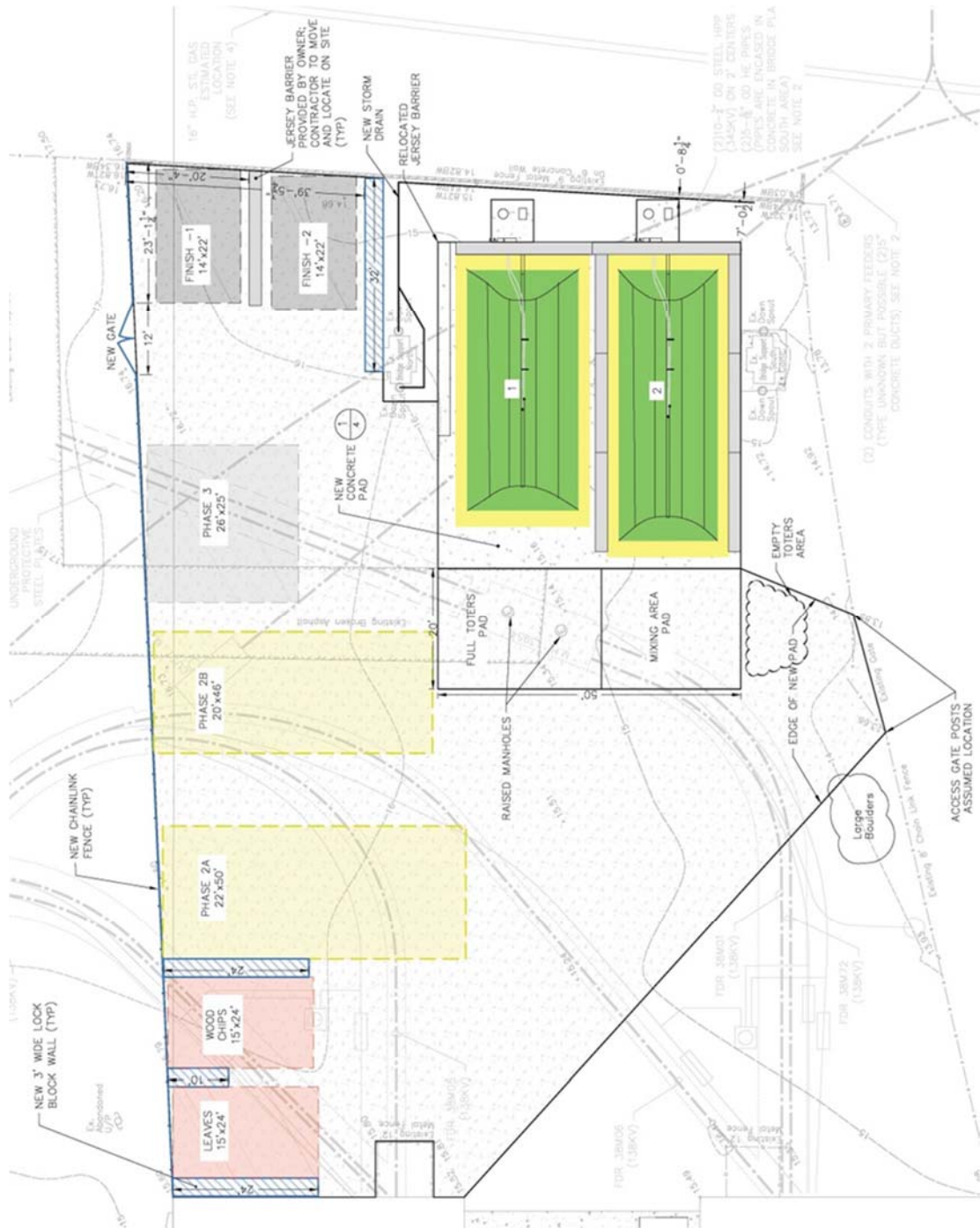
Figure 2: Site Plan